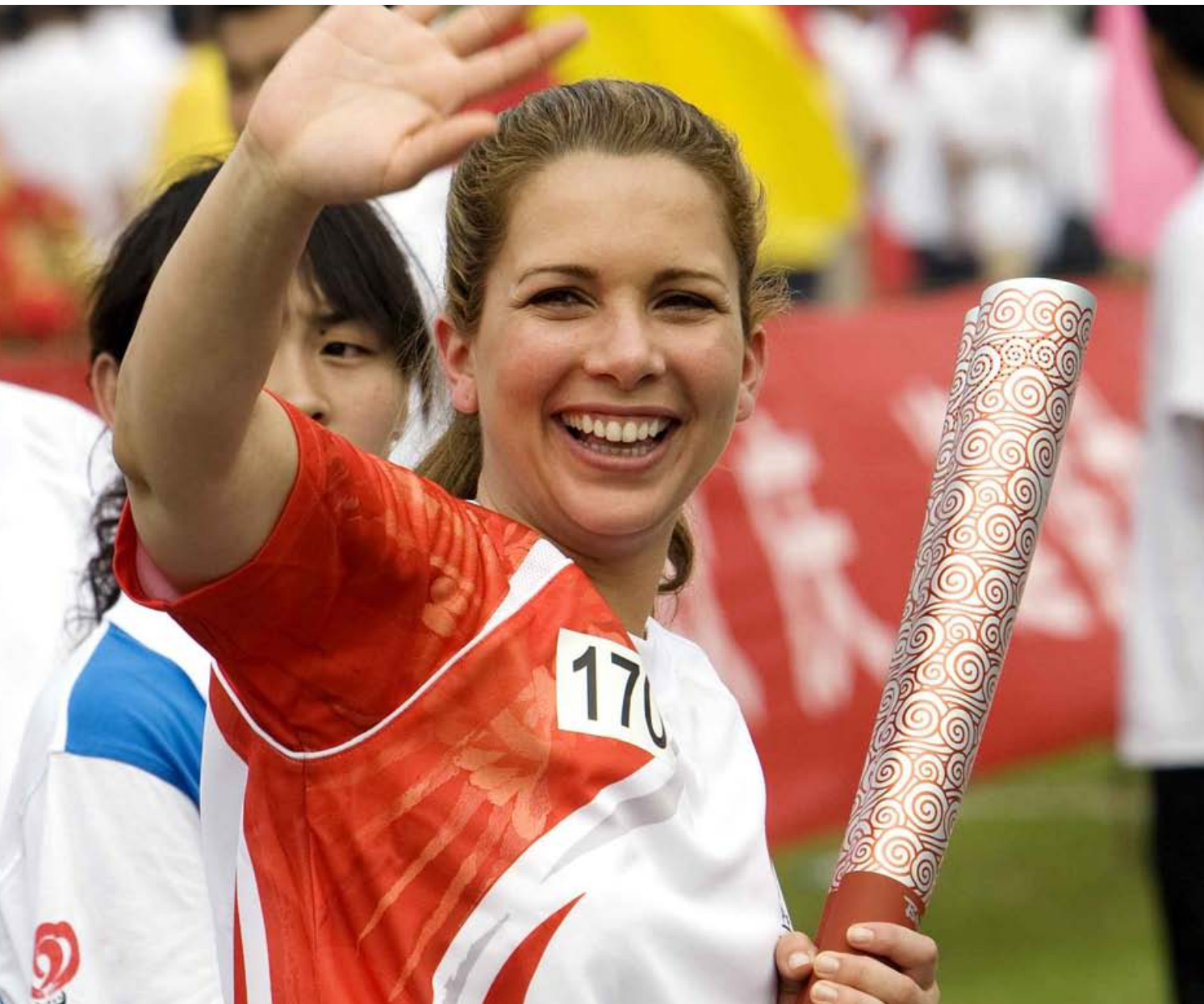
▲ HRH Princess Haya, who is an IOC Member, taking part in the Torch Relay at the Beijing Olympic Games

I was so proud of the riders from all of the emerging nations but of course the performances of the riders from the Arab world have a special place in my heart and I am really pleased that I managed to watch all of them compete and had the chance to talk to many of them in the stands before and after their competitions.