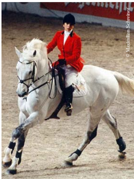
▼ HRH Princess Haya riding Come On, Frankfurt 1998

athletes and with the generations who will follow them to be very clear about what it is we are working to achieve. We need them to come with us on that journey and in the end we must ensure that athletes understand that they are the people responsible for the animals that they ride and that the welfare of the horse is the most important aspect of the sport.